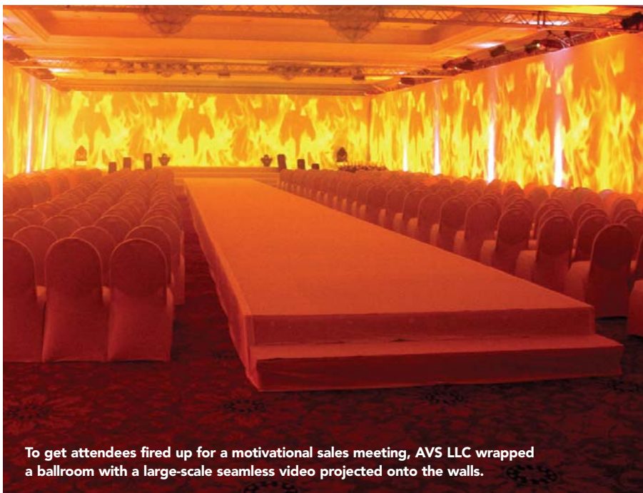
To get attendees fired up for a motivational sales meeting, AVS LLC wrapped a ballroom with a large-scale seamless video projected onto the walls.

Experts weigh in on the growing use of video and content to produce event decor.