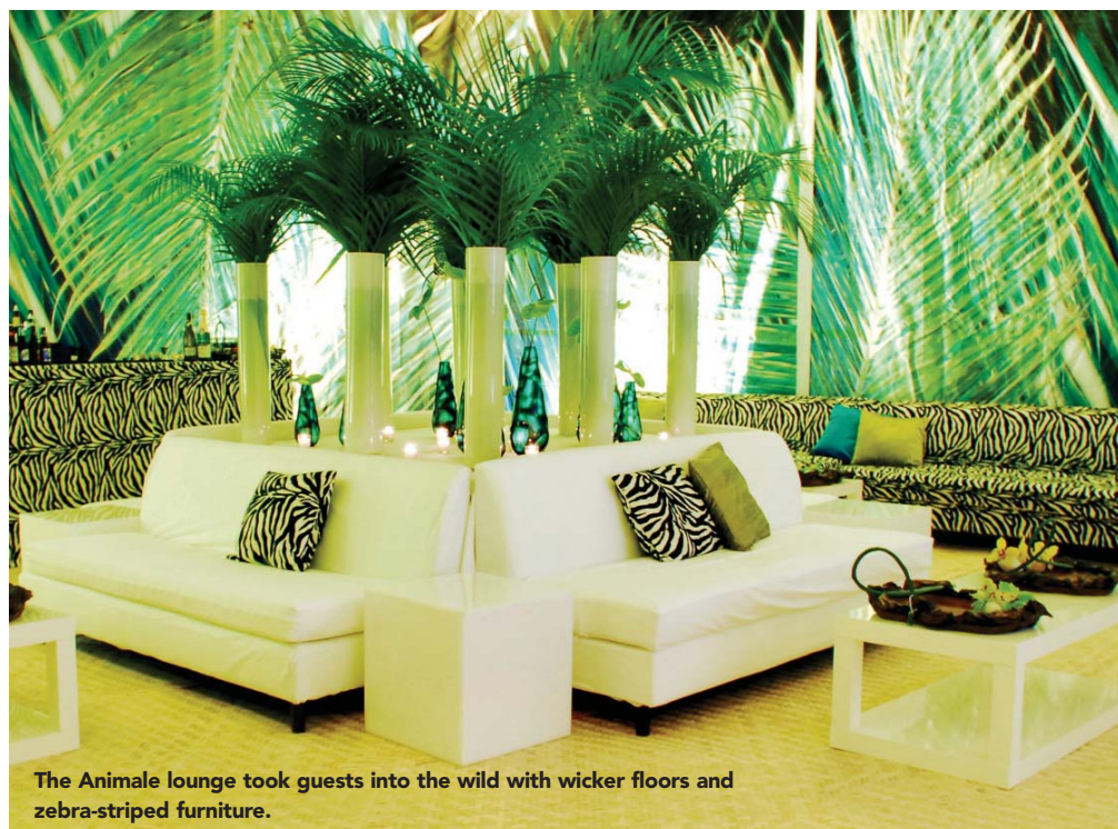
The Animale lounge took guests into the wild with wicker floors and zebra-striped furniture.