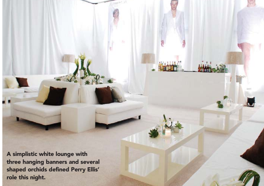
A simplistic white lounge with three hanging banners and several shaped orchids defined Perry Ellis' role this night.