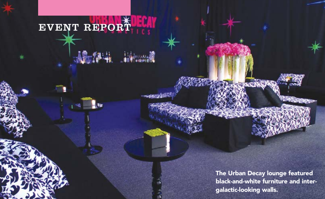
The Urban Decay lounge featured black-and-white furniture and intergalactic-looking walls.