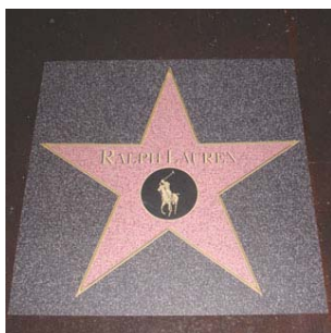
A "Walk of Fame" was put down in the entrance corridor,