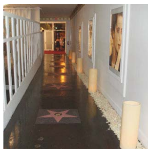
Large candles and white rose petals added to the decor in