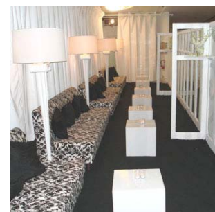
An intimate lounge designed by Nuage Designs pulled in