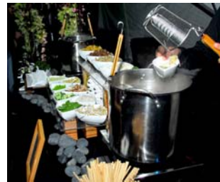
A sukiyaki station was just one of the made-to-order food stations available.