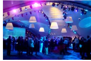
Everlast Productions drenched the tent in colorful blue and pink lighting and projections of the property's rendering.