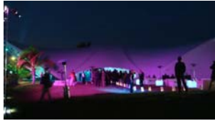
The outside of the tent was lit with projections of colorful flowers and resort images.