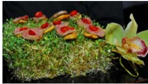
Passed hors d'oeuvres included truffled lamb loin on a pita crostini served on a bed of alfalfa.