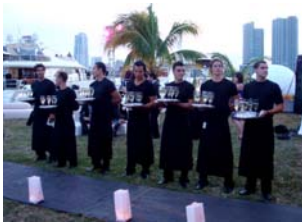
Waiters served champagne to guests as they arrived.