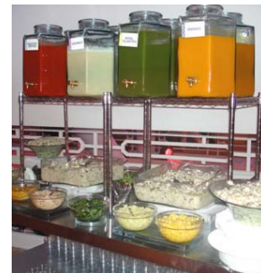
The ceviche stations offered a choice of scallop or mahimahi, four sauces, and a variety of