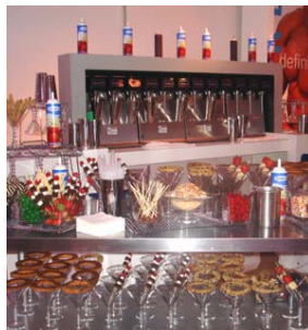
Vanilla and chocolate milkshakes were served in chocolate-chip-cookie- or