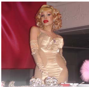
Amanda Lepore posed on stage for photographers throughout the evening,